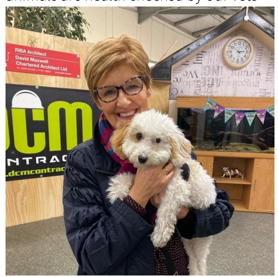
before being rehomed and a home check is carried out to ensure a successful match.

Where an individual is no-longer able to look after their companion animal because of their changed circumstances or where a companion animal has been abandoned, the USPCA will ensure the animal finds a new caring owner. All animals are health checked by our vets