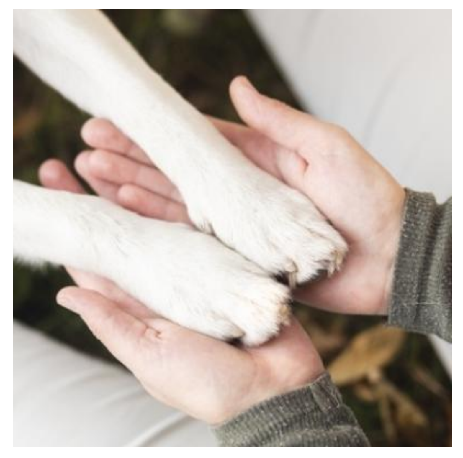
Donor Care and Retention Officer Information Pack